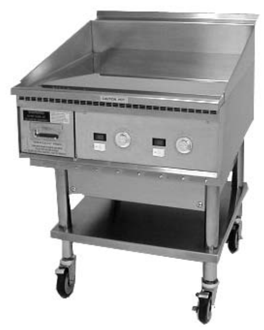
*Stand with casters or 4" legs are optional

The smooth surface of the MIRACLEAN® prevents food particles from being trapped as they are in steel plate griddles. The surface virtually eliminates flavor transfer.